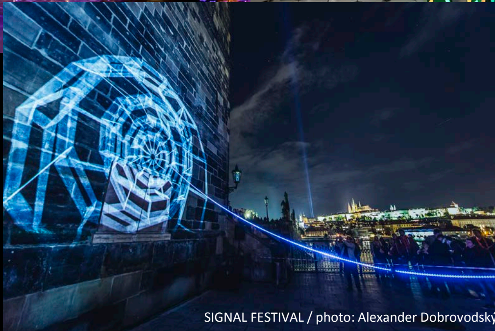
SIGNAL FESTIVAL

Artistic displays of light technologies aimed at broad public took place in the big Czech cities. Video mapping festival Septembeam in Olomouc in September, SIGNAL festival in the streets of Prague in October or light show on the occasion of the Museum Night in the Technical Museum in Brno in May were among them.