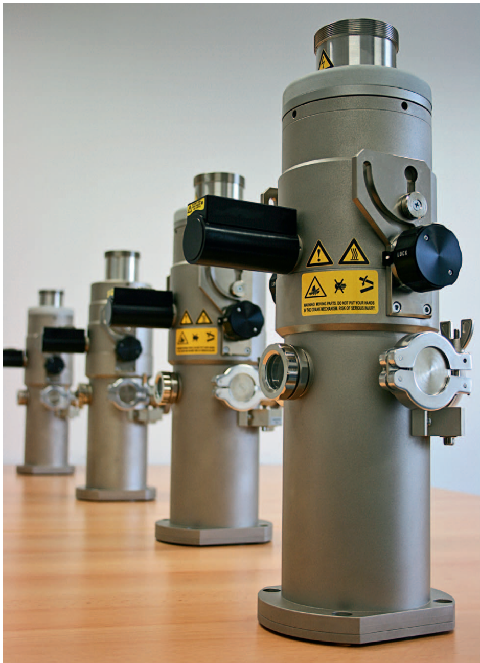
Electron guns for electron beam welding