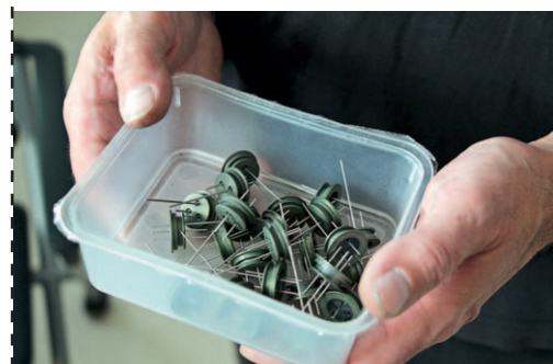
Electrical vacuum feedthroughs