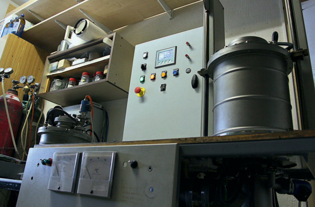
Improved vacuum furnace