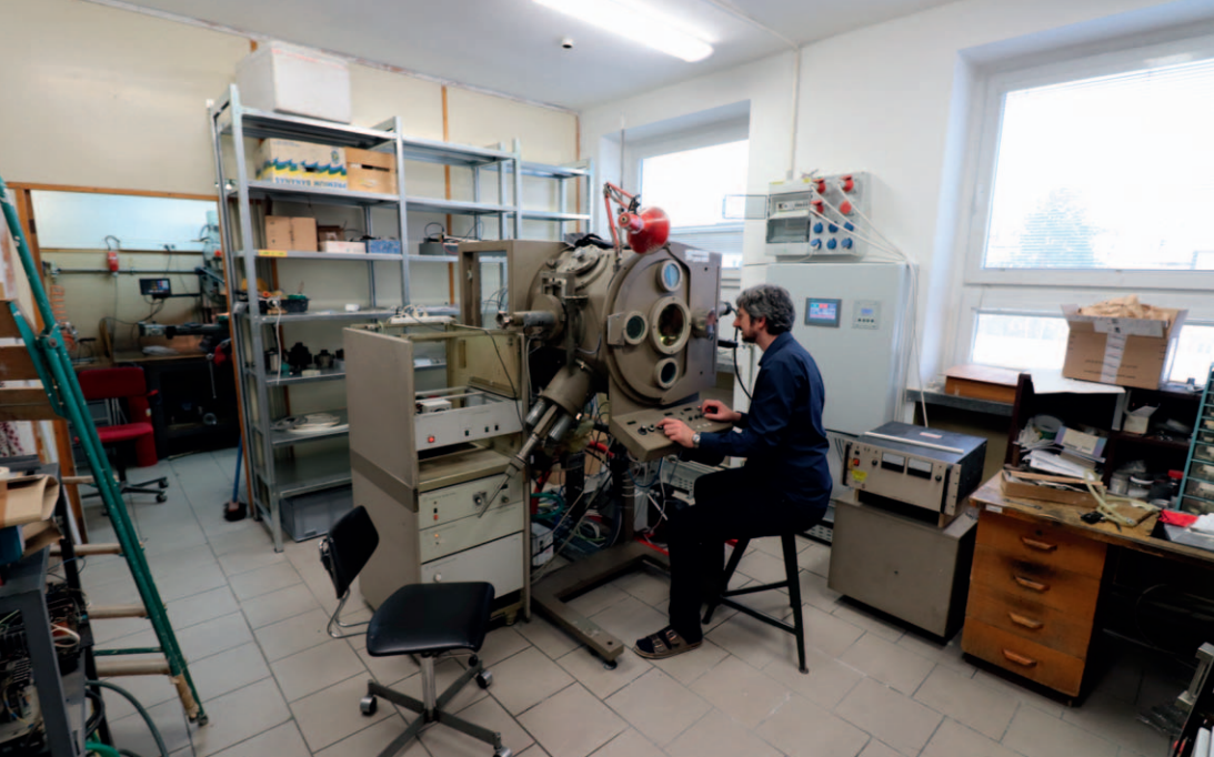
Electron beam welder