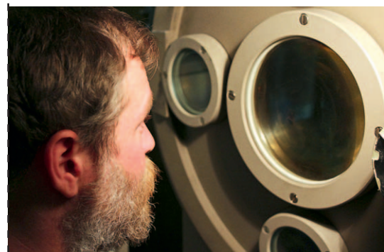
Electron beam welding